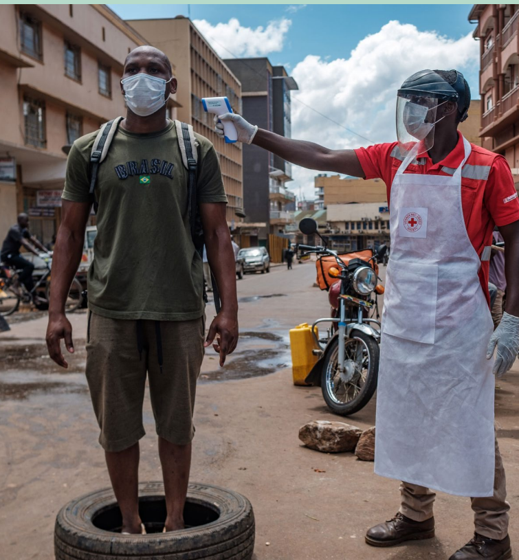
●● Kampala, Uganda, April 2020. A Red Cross volunteer measures the temperature of a man before he can enter Nakasero market.

This crisis starkly illustrates what happens when we fail to safeguard the human rights of vulnerable populations. It also demonstrates the dangers of maintaining distinctions between citizens and non-citizens, and formal or informal workforces to determine access to social protections. It is often those who are excluded from the social safety net who need its protection the most. In the long term, the crisis presents an opportunity to rethink the systems and structures that have created these risks and address gaps in protection. While this report focuses on immediate risks and actions, Walk Free is committed to working with civil society, businesses, and governments to explore these longer-term challenges and solutions in the weeks and months ahead.