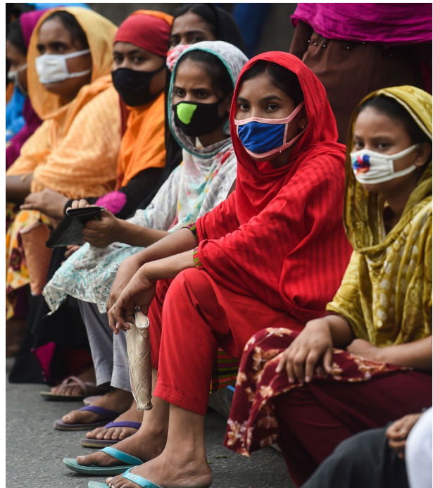
●● Dhaka, Bangladesh, April 2020. Workers from the garment sector block a road during a protest to demand payment of due wages, saying they were more afraid of starving than contracting the coronavirus.