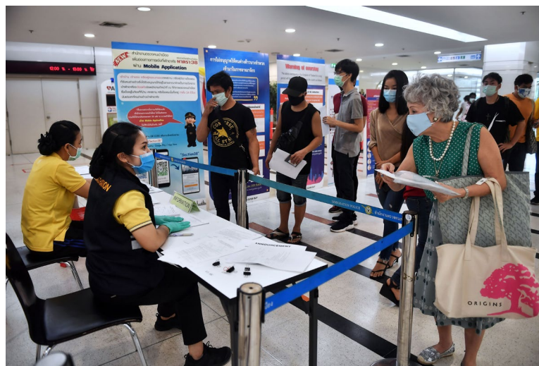
●● Bangkok, Thailand, April 2020. People stand in line to renew their visas at the Government Immigration Center in Bangkok on April 8, 2020.

Countries such as Austria, 111 Germany, 112 Switzerland, 113 Tunisia, 114 and parts of Italy 115 have made efforts at ensuring migrants have access to information about COVID-19 and/or the government's response by making information available in multiple languages.