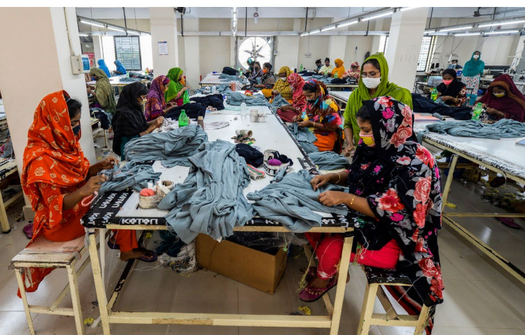
●● Asulia, Bangladesh, April 2020. Garment labourers work in a garment factory during a government-imposed lockdown as a preventative measure against the spread of the COVID-19 coronavirus.

While there has been widespread condemnation of brands that have cancelled orders already in production, there are many examples of companies honouring these commitments and taking other steps to support suppliers.