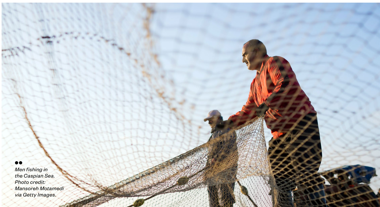
●● Men fishing in the Caspian Sea.

In Lebanon, there have been reports of increased physical and sexual assault as a result of being 'trapped' with abusive employers. 23 The International Domestic Workers Federation has reported that some domestic workers are being subjected to increasingly stressful and hazardous working environments as a result of a "substantial increase in workload to ensure cleanliness and hygiene without overtime work compensation." 24 The remainder of the workforce are facing rapid job losses. In the USA, 70 per cent of domestic workers were out of work and did not know if they would be able to return to their jobs after the pandemic. 25