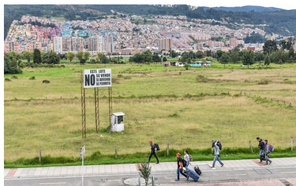
●● Bogotá, Colombia, April 2020. Venezuelan migrants walk with their belongings on the side of a highway out of Bogotá. Thousands of Venezuelan migrants living in Colombia have lost their jobs and in some cases been evicted from their homes due to the recession caused by the lock down to halt spread of COVID-19. Groups of Venezuelan gather in walking caravans and head the border crossing in Cúcuta, 550 km from Bogotá.

Some governments have made efforts to expand access to financial benefits and sick leave not only to their own formal workforce, but to informal workers and non-citizens. For example, New Zealand has extended its government-funded COVID-19 Wage Subsidy to any worker (including temporary visa holders) who was legally working in New Zealand at the time it went into lockdown. 92 Thailand has extended economic support for those who cannot work due to COVID-19 to include migrant workers who have contributed to the Social Security Fund for at least six months and workers in Thailand’s informal sector. 93 The Canada Emergency Response Benefit covers permanent, temporary, casual, self-employed, gig, 94 and eligible temporary foreign workers and international students. 95 Argentina’s economic package includes singular payments to households depending on income from an informal labourer or self-employed worker. 96 Colombia’s support package targets vulnerable workers in the informal sector, however, there are concerns for the large Venezuelan migrant population who are excluded from this support. 97